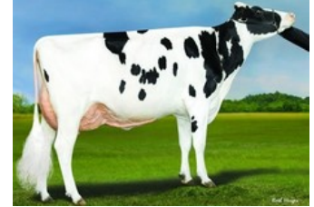
Bomaz Medley 8301 RDC EX-94, same

Megarun RDC x Rover x GP-84 Riveting x Salvatore Rc x VG-88 Delta x GP-81 AltaEmbassy x VG-85 Robust x VG-85 Man-O-Man x VG-85 Lancelot x VG-85 Addison