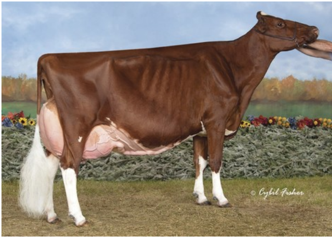
KHW Regiment Apple-Red EX-96