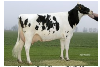
Koepon Shot Classy 17 VG-85