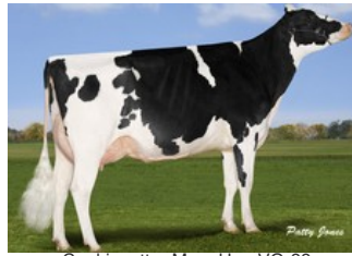
Cookiecutter Mom Hue VG-88