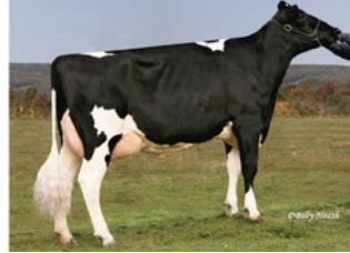
Cookiecutter GLD Holler VG-88