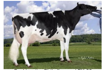
Cookiecutter Shthollerwood EX-92