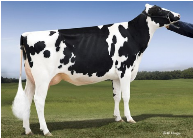
Lookout Pesce Epic Hue VG-86