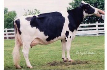
Mayerlane-DK Hiawatha EX-90

Foundation RDC x Parfect x VG-89 Swingman Red x VG-86 Salvatore Rc x VG-89 Rubicon x GP-83 Aikman RDC x VG-85 Man-O-Man x VG-87 Mascol x VG-88 Durham x EX-90 Rudolph