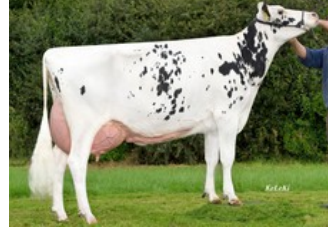
WEU Pioneer Extra VG-86