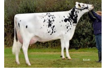
WEU Extra VG-86

Revolution x Palmer x VG-88 Kensington x Lighter x EX-90 Supershot x VG-85 Shotglass x VG-86 Pioneer x VG-88 Man-O-Man x VG-85 Mascol x VG-88 Sinatra