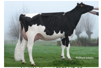
Lis K&L Xemmi 7970 VG-88