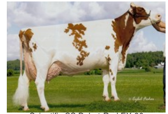
Scientific SS Debut-Red EX-90