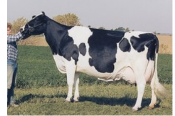
C Glenridge Citation Roxy EX-97

Figaro x VG-85 Skiresort RC x Shimmer RDC x Apprentice RDC x VG-85 Powerball-P x Ladd P x VG-88 Advent-Red x EX-90 September Storm x EX-92 Durham x EX-90 Jubilant RF