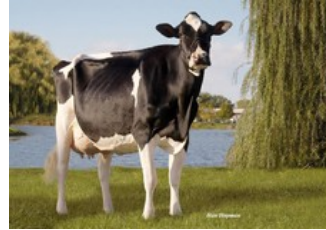
Scientific Debutante Rae EX-92