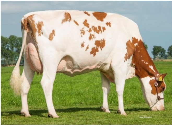
Future Dream H. Debu-Red VG-88