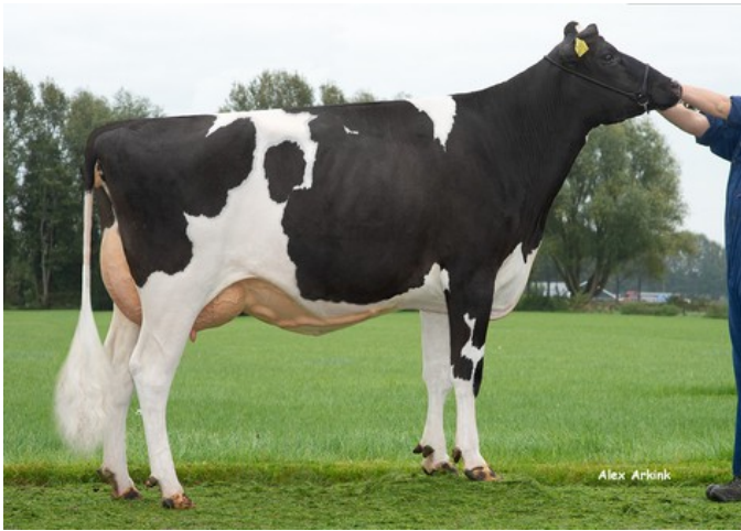
A-L-H Slush GP-84