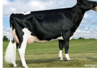
Ronelee Boliver Dreary VG-86