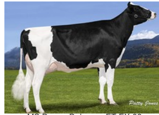
MS Dreary Delorean-ET EX-93