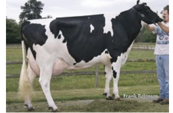
Ronelee Outside Dabble EX-91

Hypnotic x GP-83 Einstein x GP-84 Redrock x Delta x GP-82 Supersire x EX-93 Numero Uno x VG-86 Boliver x EX-91 Outside x EX-93 Rudolph x EX-95 Mark