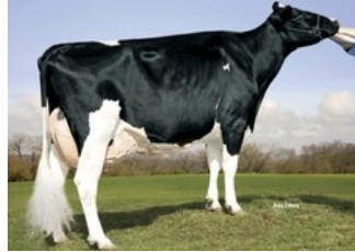
Kamps-Hollow Durham Altitude EX-95