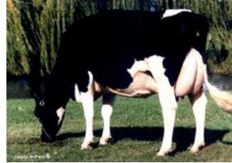
Snow-N Denises Dellia EX-95