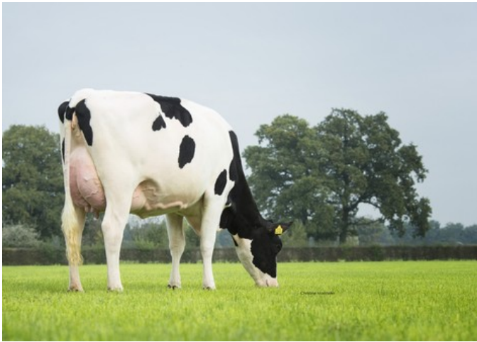
Holbra Sandian VG-88