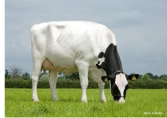
Holbra Sana VG-89