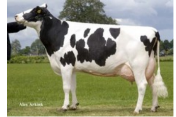
Holbra Petra EX-90

Mahomes x VG-87 AltaZarek x VG-88 Casper x VG-87 Jedi x VG-86 Kingboy x VG-88 Meridian x VG-89 Snowman x VG-85 Bolton x VG-87 O Man x EX-90 Morty Progenesis Mahomes met BB & A2A2.