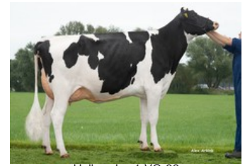
Holbra Joy 1 VG-88