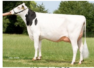
Holbra Joy VG-87