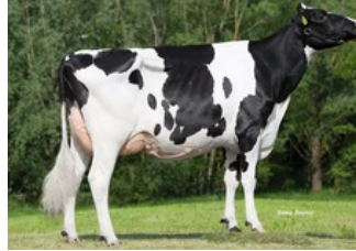
Broekhuis RUW Elite VG-86