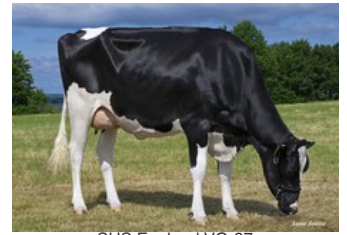
SHS England VG-87