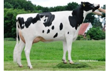
WEU Willow GP-83

Migel x GP-83 Vh Crown x VG-87 Cameron x VG-86 Barclay x Molotov x GP-83 Shamrock x VG-85 Man-O-Man x VG-88 Colby x VG-87 Augustine x VG-85 Ramos