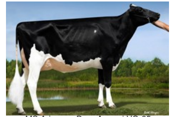
MS Ariannas Door Armani VG-85