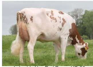
Lakeside Ups Red Range VG-86