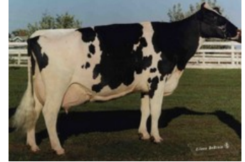
Golden-Oaks Mark Prudence EX-95

Gameday x GP-84 AltaAltuve RDC x VG-86 Salvatore Rc x VG-89 Rubicon x GP-83 Aikman RDC x VG-85 Man-O-Man x VG-87 Mascol x VG-88 Durham x EX-90 Rudolph x EX-95 Chief Mark