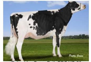
Rainyridge Super Beth RDC VG-86