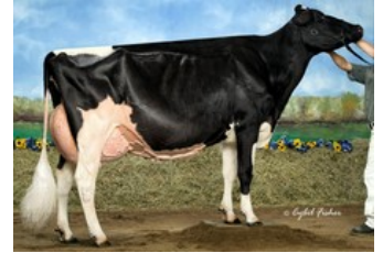
Rainyridge Talent Barbara RDC EX-95

Perfect x VG-86 Nacash x Marquee x EX-93 Delta x VG-86 Supersire x VG-86 Superstition x EX-95 Talent x EX-95 Outside x EX Milan x EX-94 Tony