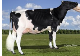
Calbrett Supersire Barb RDC VG-86