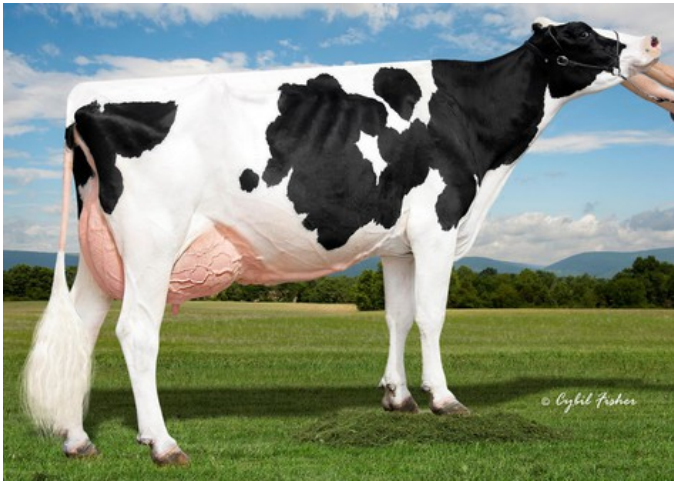
Ms DG Delta Bridgett RDC EX-93