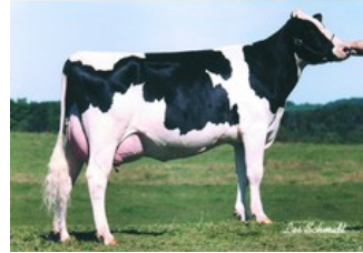
Dixie-Lee Adrielle-ET VG-85