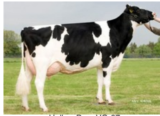
Holbra Pam VG-87