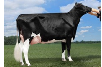
KHW Alxndr Ayako VG-85

Money P x VG-88 Solitair P Red x VG-88 Lucky PP-Red x VG-85 Salsa RC x VG-87 Supersire x VG-85 Alexander x EX-91 Goldwyn x EX-95 Durham x EX-93 Prelude x EX-94 Jubilant RF