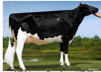
MS Ariannas Door Armani VG-85