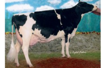
MS Kingstead Chief Adeen EX-94

Doc x Crushabull x VG-89 Archrival x VG-85 Doorman x EX-94 Atwood x EX-94 Skychief x EX-94 Starbuck x Sheik