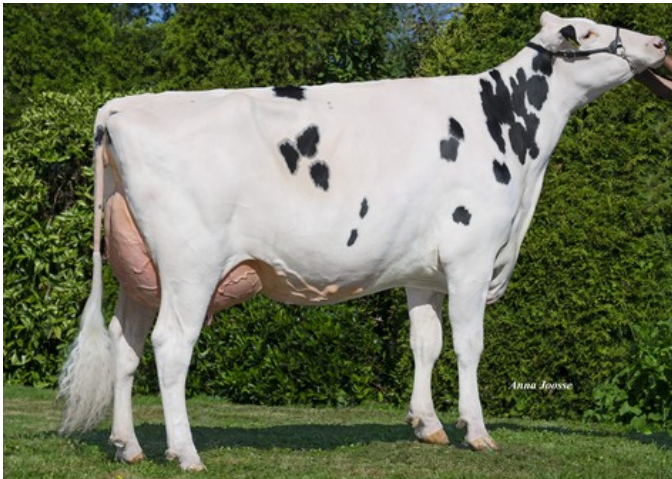
HC Archrival Arianne VG-89