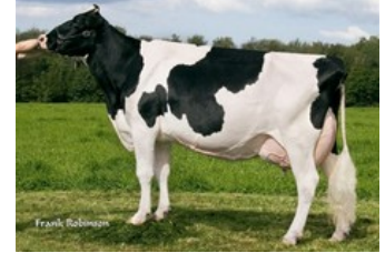
Gen-I-Beq Durham Sunshine VG-88

VG-85 Perfect x VG-88 Noble x VG-86 Charley x Missouri x Supersire x VG-88 Freddie x VG-85 Bolton x EX-90 Dundee x VG-88 Durham x VG-86 Formation