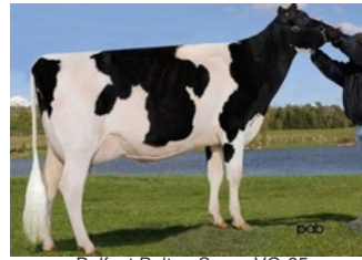
Belfast Bolton Supra VG-85