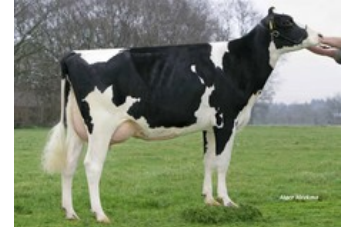
Holbra Manoa VG-85

Star P RDC x VG-86 Rubels-Red x VG-86 Salvatore Rc x VG-89 Rubicon x GP-83 Aikman RDC x VG-85 Man-O-Man x VG-87 Mascol x VG-88 Durham x EX-90 Rudolph x EX-95 Chief Mark