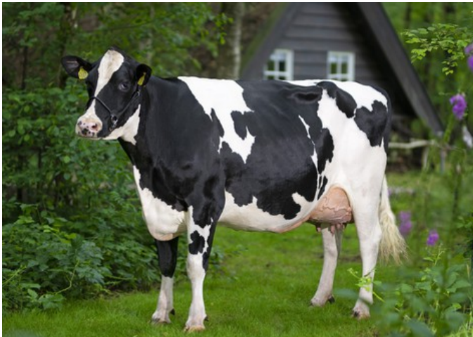
De Oosterhof Dg Rose RDC VG-89