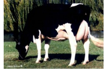
Snow-N Denises Dellia EX-95

G-78 Pikachu x Bali x VG-86 Gymnast x VG-86 Supershot x VG-85 McCutchen x VG-87 Altalota x VG-87 Planet x EX-92 Bolton x VG-87 Forbidden x VG-89 BW Marshall