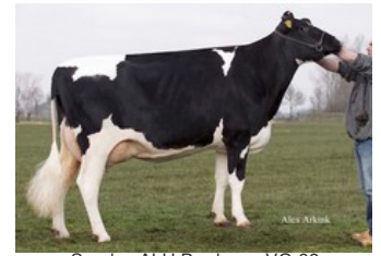
Sunday ALH Prudence VG-88