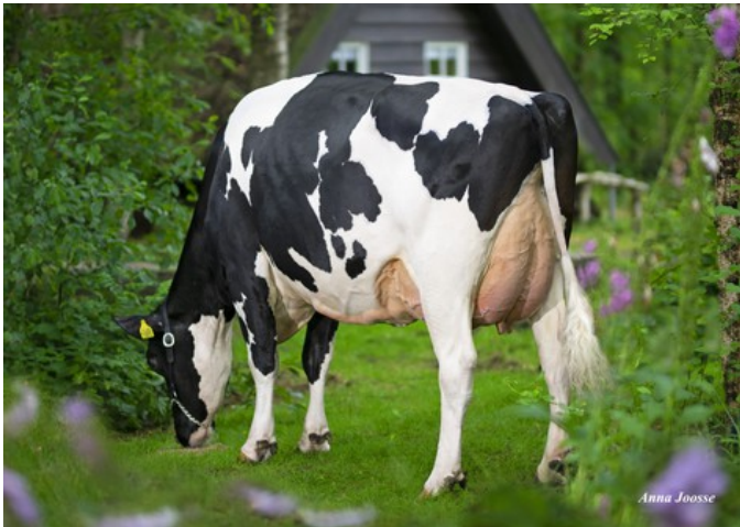
De Oosterhof Dg Rose RDC VG-89