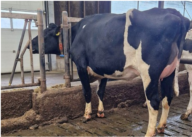
3STAR OH Mazzali