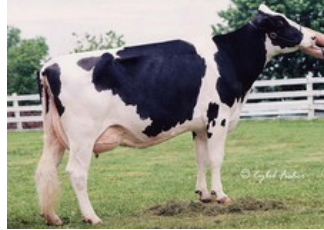
Mayerlane-DK Hiawatha EX-90