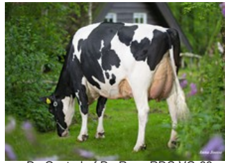
De Oosterhof Dg Rose RDC VG-89