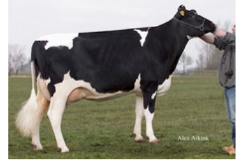
Sunday ALH Prudence VG-88

GP-84 Sputnik RDC x VG-85 Swingman Red x VG-86 Salvatore Rc x VG-89 Rubicon x GP-83 Aikman RDC x VG-85 Man-O-Man x VG-87 Mascol x VG-88 Durham x EX-90 Rudolph x EX-95 Chief Mark