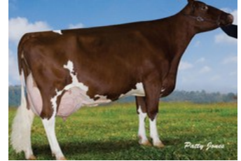
Aldonhill Milestone Brilliance VG-88

GP-84 Best Benz x GP-83 Hotspot P x VG-87 Hologram-P x GP-83 Chipper-P x GP-84 Bookem x VG-86 Man-O-Man x VG-87 Mr Burns RC x VG-88 September Storm x VG-88 Talent x VG-87 Dragon RDC