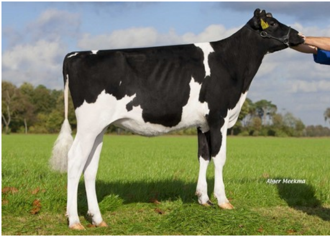
Zandenburg Uno Hispanja VG-88