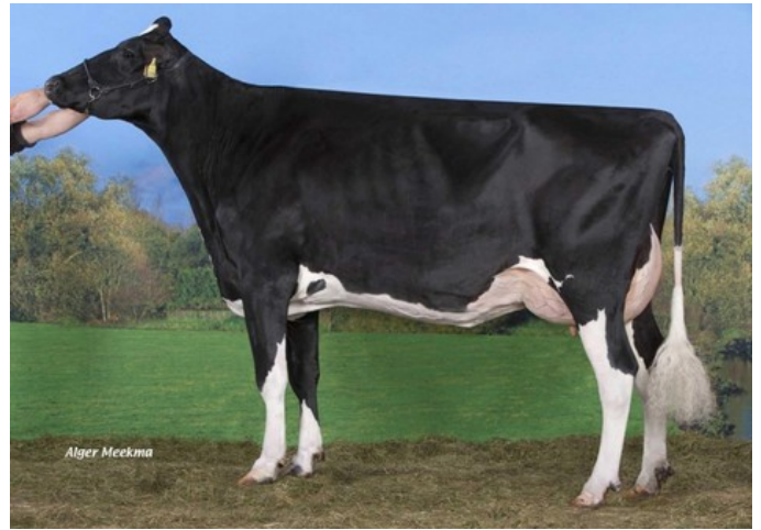
Hispan Super / KNS High Tech GP-84

VG-85 Einstein x VG-88 Redrock x VG-87 Modesty x VG-86 Commander x VG-88 Numero Uno x GP-84 Superstition x VG-88 Manager x VG-89 Jocko x VG-87 Formation x VG-88 Enjoy Rota