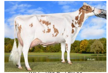
Wilder K25 Red EX-90