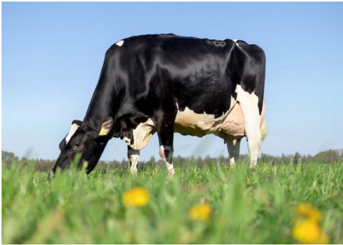
Poppe Kanu 2037 RDC VG-86