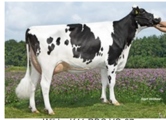
Wilder K41 RDC VG-87