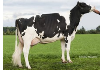
Wilder Kanu 111 RDC VG-88