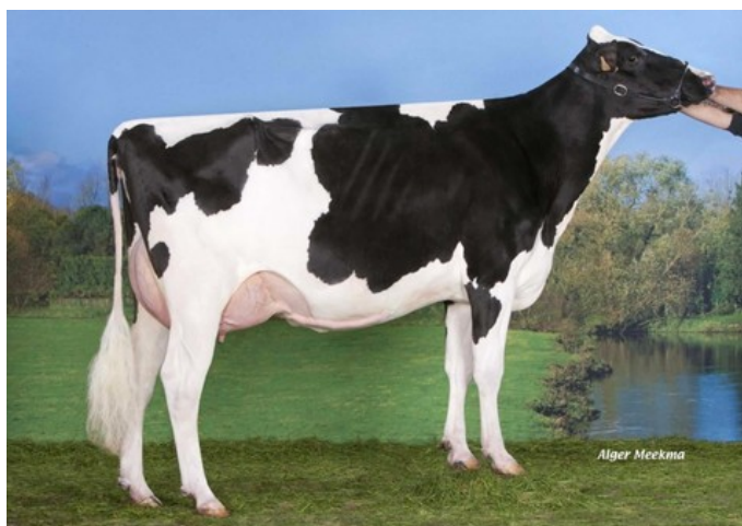
DKR Bayla VG-86