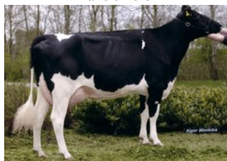
SH Jocko Jen VG-87