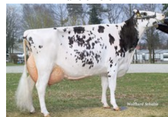
DT Spottie EX-93 (s. Derry), same family

GP-84 Bellroy x VG-87 Imax x Missouri x G-79 Smurf x VG-86 Garrett x VG-87 Shottle x VG-87 Jocko x VG-87 Rudolph x VG-85 Grand x VG-87 Prelude