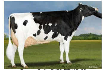
Bomaz Delta 7173-ET VG-88