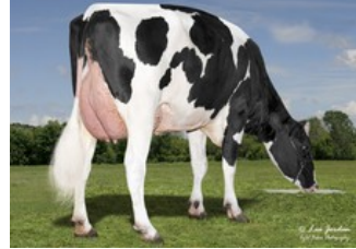
Bomaz Delta 7166 (Delta x Bomaz Frido)