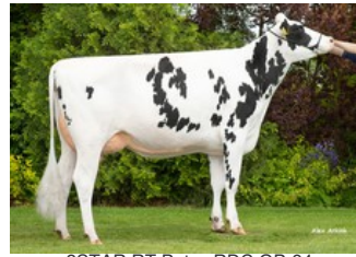
3STAR RT Patsy RDC GP-84