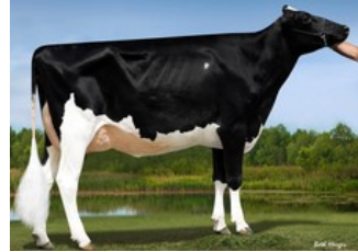
MS Ariannas Door Armani VG-85