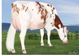
Lesperron Aikman Sofia-Red VG-88-4yr