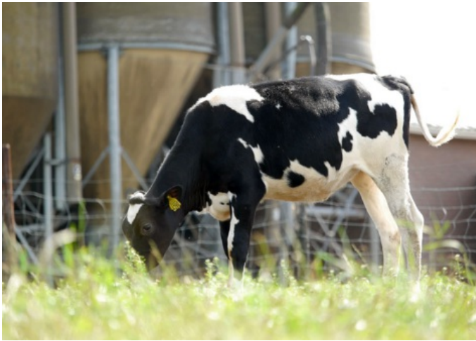
Drouner 3STAR Mabel 1730 GP-83