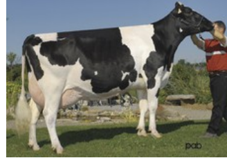
Gen-I-Beq Durham Sherry VG-87