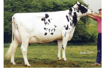
Glen Drummond Shower EX

Solitaire P Red x VG-85 Silver x GP-83 Earnhardt P x GP-82 Colt P x VG-85 Socrates x VG-87 Goldwyn x VG-87 Durham x VG-86 Formation x VG-88 Aerostar x EX Enhancer