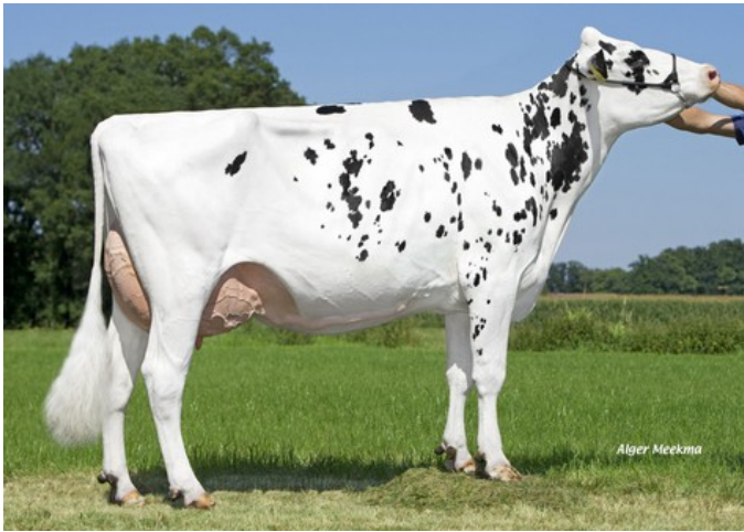
Schreur Serena 7 P VG-85