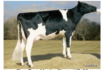
Pine-Tree Martha Sheen VG-86