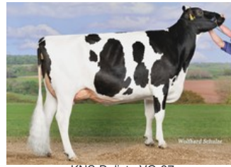
KNS Dalista VG-87