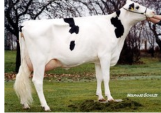
KNS Daylight EX-90