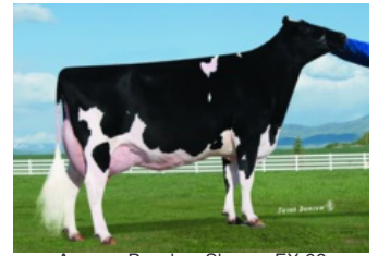
Ammon-Peachey Shauna EX-92