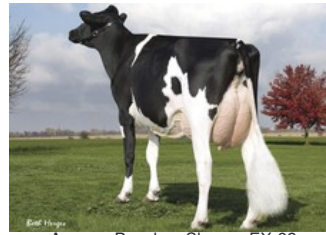
Ammon-Peachey Shauna EX-92