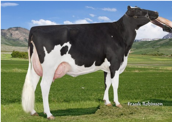
Seagull-Bay Shauna Saturn VG-87