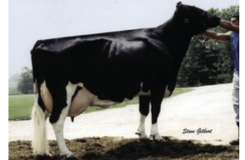
Wesswood-HC Rudy Missy EX-92

VG-86 Doc x VG-88 Modesty x GP-83 McCutchen x VG-87 Man-O-Man x EX-92 Planet x VG-86 Shottle x VG-86 O Man x EX-92 Rudolph x EX-90 Bell Elton x VG-87 Mandingo