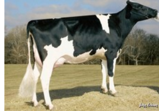
Pine-Tree Martha Sheen VG-86