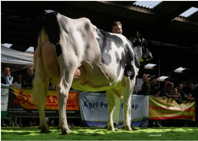
KNS Molina P RDC VG-89