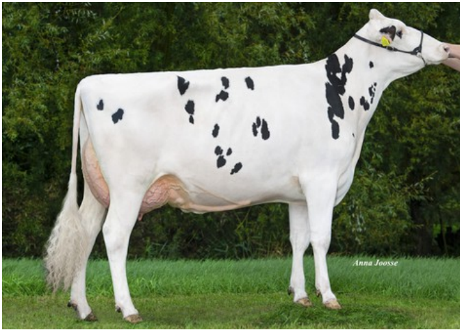
Dykster K&L SD Carry VG-88