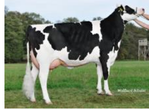
WEH Bronco Janet VG-85