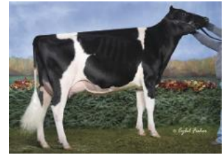
Arethusa Affection EX-92