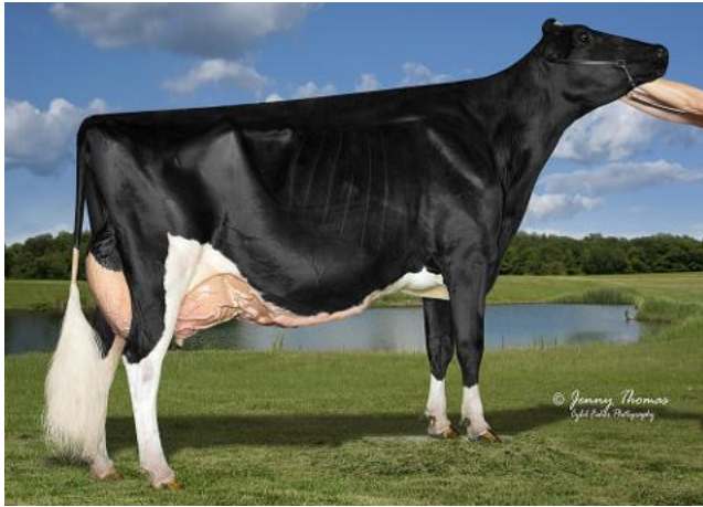
Arethusa Fever Almira EX-96