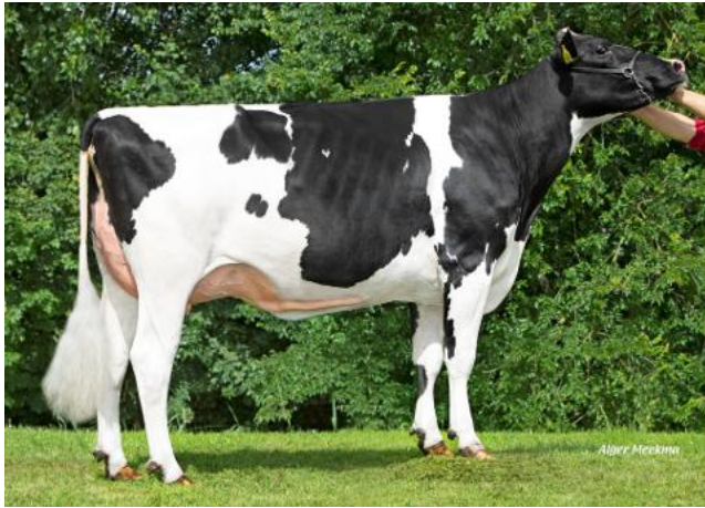
Koepon Ranger Classy 496 RDC VG-87