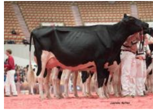
Arethusa Fever Almira EX-96