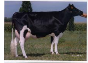
Royal Idevra Egna VG-85

Fraaie Donald met hoge gehalten, +1.55 PTAT. Productieve koefamilie, veel stieren bij de KI internationaal. Voert terug naar de bekende Amerikaanse fokkoe Ricecrest SW Kay.