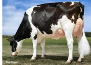
Luck-E Advent Asia RC EX-94