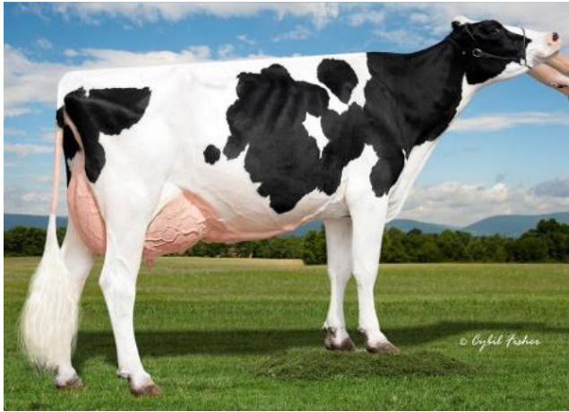
Ms DG Delta Bridgett RDC EX-93