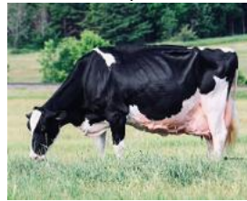
Blondin Goldwyn Subliminale EX-97