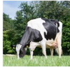
HIN Mexico EX-91