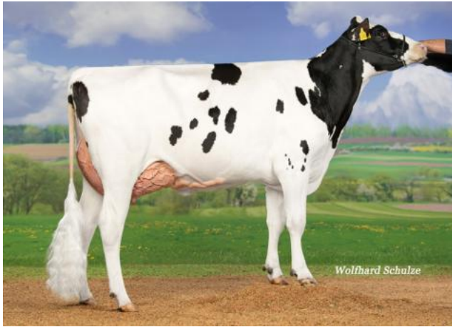
RR Elies P RDC GP83, mat-sister Edinburgh VG-85