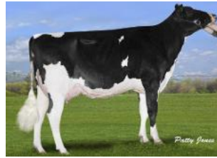
MS Lookout Pesc Bkm Bria VG-86