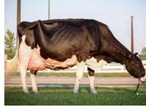
Blondin Goldwyn Subliminale EX-97