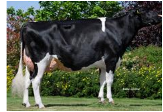
PH Alice P VG-85