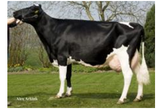
Barnkamper Marilyn 154 VG-88