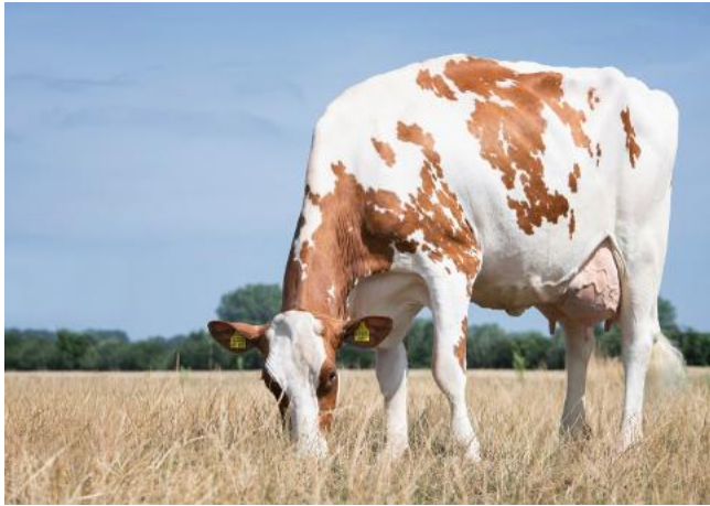
Wilder Kasalla EX-90