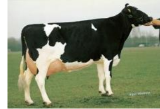
Barnkamper Marilyn VG-89

Roodfactor Sainz, 152 gRZG met A2A2 & BB. Uit de Barnkamper Marilyn's, allround met veel kilo's vet. Mooi kalf om roodbonte koefamilie mee op te bouwen.