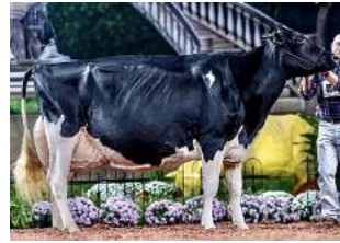
Rach-Len Dundee Lilly EX-97