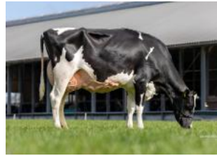
GEN Aniek VG-85