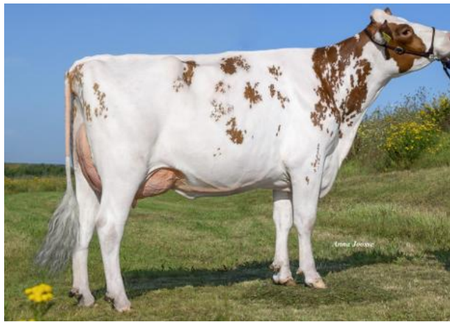
3STAR OH Red Rose VG-85