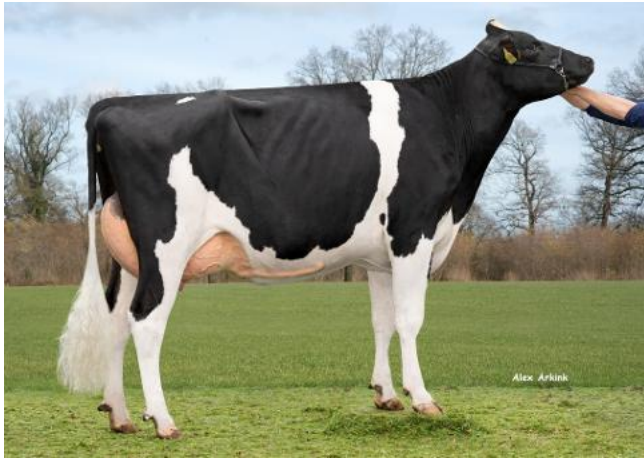
De Oosterhof 3STAR Marlien GP-82