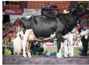
Ms Beauty Black Velvet EX-96