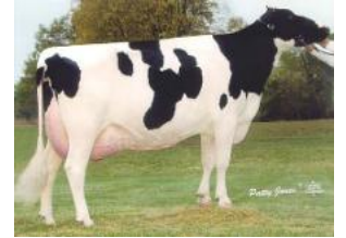
Tri-Day Ashlyn EX-96

Showpotentie met Ashlyn EX-96! Altitude-Red is Premier Sire R&W World Dairy Expo 2025! 6 generaties Excellent op rij, top exterieur!