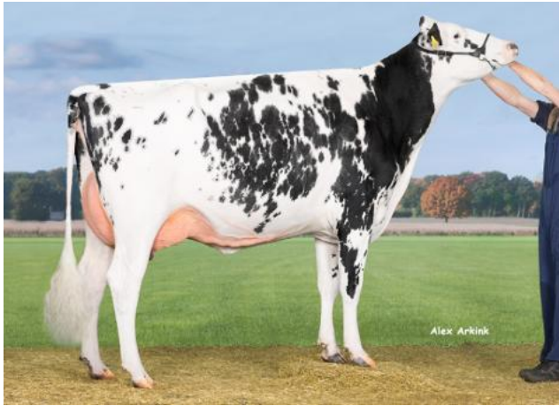
Watermolen Archival Cammolle VG-88