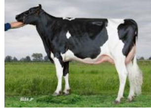
Familymember Isolabella Nacash Emblema