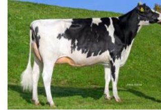
Familymember 3STAR OH Maiball

Vroege en één van de hoogste Pirelli dochters voor gRZG en RZ€! Enorm veel productie-aanleg, met gezondheid & A2A2. Uit de succesvolle K&L OH Mabel-familie, met vele stieren bij de KI. Magello-halfbroer is aangekocht door Qnetics.