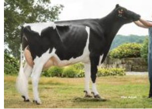
Maybelline Tual VG-85