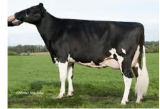
Wilder Kairo 55 RDC VG-89

Roodbonte Swat P RDC, 154 gRZG & 131 gRZE Zeer hoge vruchtbaarheid-, uiergezondheid- en levensduur-fokwaarden. De succesvolle Wilder K-familie, vele stieren bij de KI.