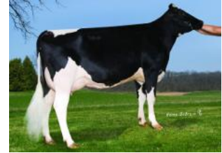
Pine-Tree Ramos Alexa EX-91

Vroege Alster met 153 gRZG, allround profiel & A2A2! Eén van de hoogste Alsterdochters, uit zeer productieve moeder. Terug naar de bekende fokkoe Pine-Tree Ramos Alexa EX-91