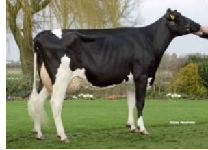
Barnkamper Marilyn 154 VG-88