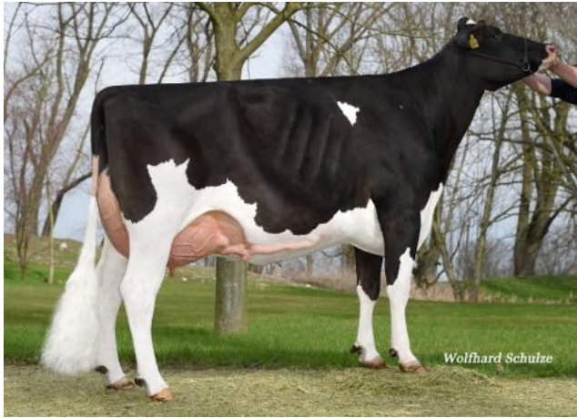
MAR Dream EX-91