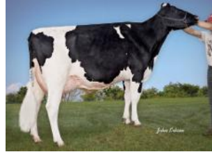
Ralma Goldwyn Clarinet EX-91