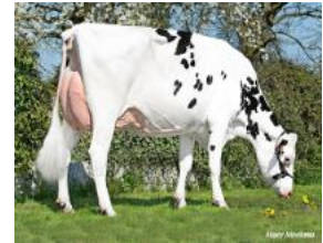
Shakilla VG85, daughter to Shakira RC VG-85