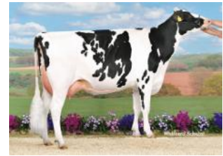
WEH Georgina VG-87

Hi-Note met 3335 gTPI, super gehalten en A2A2! Gisela bezit hoge gehalten en zeer gunstige gezondheidskenmerken. Moeder Goldmarie is volle zus van de jonge stier Comedy.