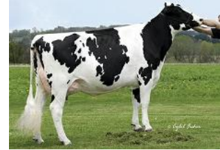
Luck-E Blitz Australia VG-87

Schitterende Hulu uit familie Attie-Red EX-92! Directe dochter uit Asia EX-94 familie, met +2.56 PTAT & +2.42 F&L. Familie van Luck-E Alt Attie-Red, R&W Res. Champ. WDE 2025!