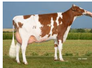
HLB 3STAR OH Rose Red GP-83