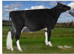
Jacobs Jasper Best VG-88