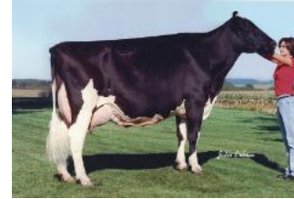
Regancrest Juror Brina EX-92

Spoelbare Real Syn met 156 gRZG, 3130 gTPI & A2A2. Allround profiel met prima gezondheidskenmerken. De Regancrest Durham Barbie EX-92 familie, altijd goed exterieur.