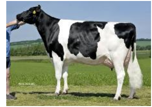
Tirs vad BT Noma VG-89