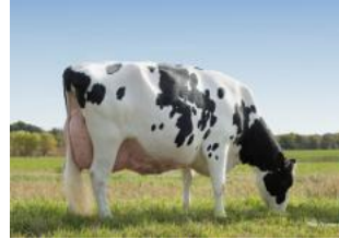
Larcrest Crimson EX-94