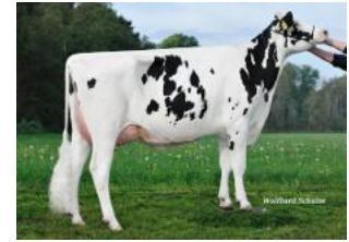
WEH Epic Jen VG-86