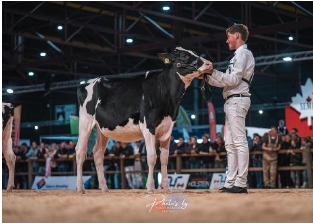
Eaton Eye Candy Lilli's Luder