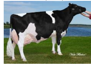
Jacobs Storm Bette EX-91

Schitterende Eye Candy, voor in de showing! Eye Candy is met +16 Conformation de #3 fokstier in Canada. Super pedigree, met Babe EX-96 & Britany EX-96!