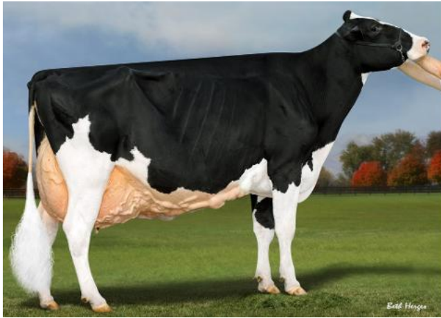
Blondin Goldwyn Subliminale EX-97