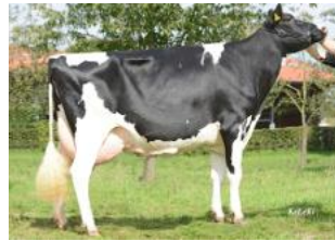
PH Akazie EX-90