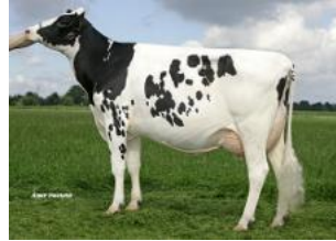
Koepon Shottle Classy 16 VG-85