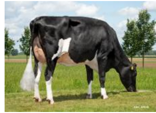
3STAR OH Mazzali GP-84