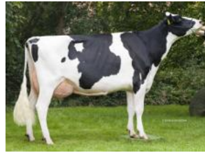
Tir An Nairobi DK2371402481 Numero Uno