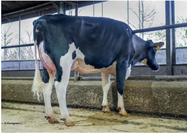
Beerzedal HiPo Pfct Emelda GP-84