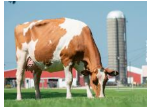
Luck-E MCGUCCI AFRO-RED EX-94