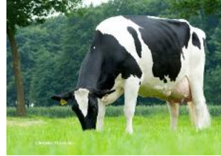
HIN Malta VG-88