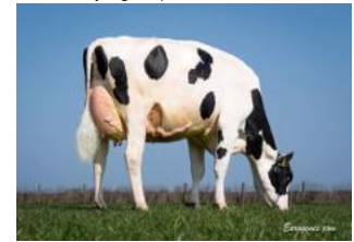
DG Brilliant RC, Resolve x Bridgett RDC

Rebel-Red (+1.64 PTAT) direct uit Bridgett RDC EX-93 - o.a. grootmoeder van DG DGF Boraz *RC! Stamkoe is Rainyridge Tony Beauty EX94, Grand Champion WDE 1999. Geweldige kans op een zeer fraaie, roodbonte Beauty. Een Modesty dochter uit Bridgett topte de National Convention Sale in 2017 af met $105,000!