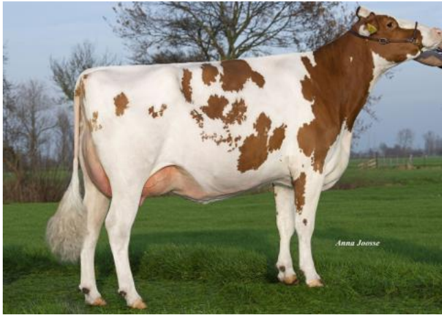
Batouwe Ailisha Salva Red VG-85