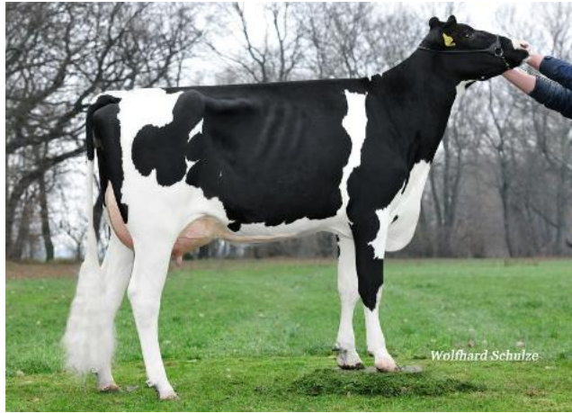
SHA Gerenuk EX-91