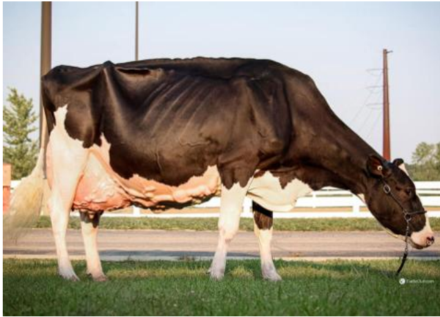
Blondin Goldwyn Subliminale EX-97

Ins. Siemers Wolf Hulu (SX). Due early July