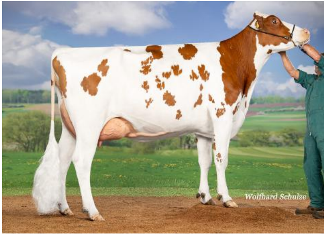
Pazifik P Red GP-84