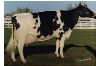
Golden-Oaks Mark Prudence EX-95

Roodfactor Anahita, direct uit Rose RDC VG-89. Zeer fraaie Anahita (+15 Conf), halfzus van Red Range VG-86! Vele topstieren, o.a. Safari, Ranger-Red, Robyn & Rammstein.