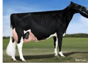
Silvermaple Damion Camomile EX-95