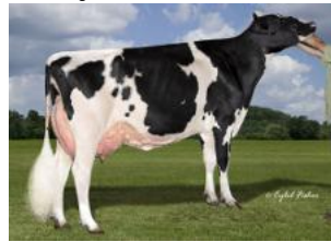
Winterhim-Wg Bax Elated EX-92