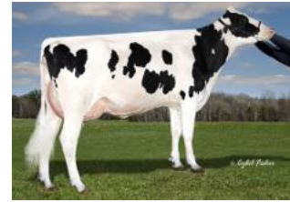
Main-Drag Rubicon Email EX-91