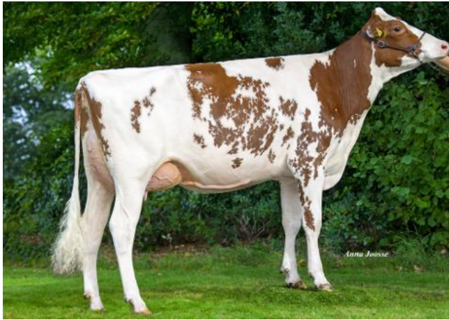
Salsa P Red VG-87