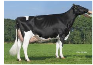
A-L-H Australia RDC VG-87