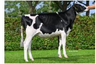
Eaton Eye Candy Lilli's Luder