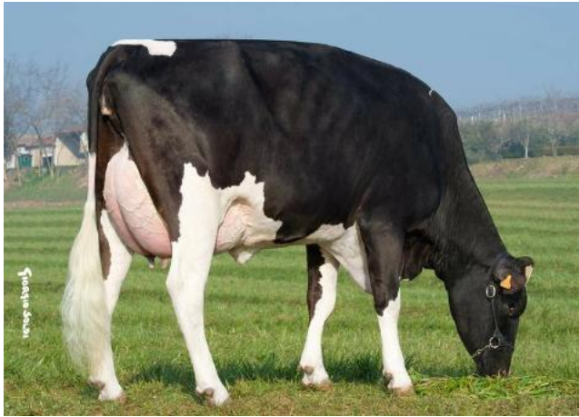
Royal Idevra Eva VG-86