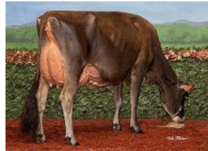
Crossbrook HG Dixie EX-94