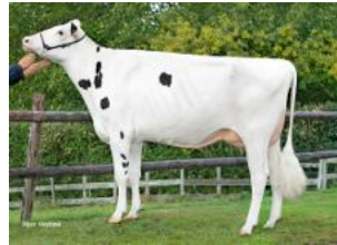
Milksource Lb Shakira RDC VG-85