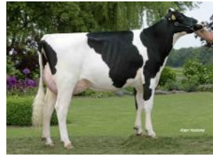
Barnkamper Marilyn 252 EX-90