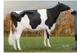
K&L OH Mabel