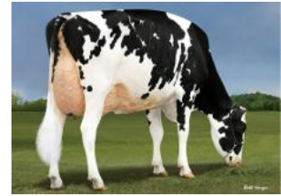
Larcrest Circadian EX-92