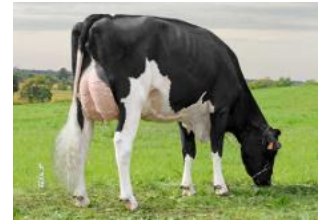
Bertaiola Casper 57 VG-85