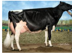
Rainyridge Talent Barbara RDC EX-95