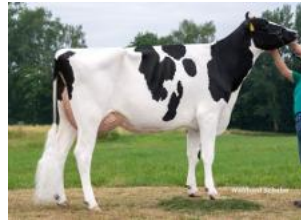
RR Elina VG-86 51676, full sister Elina GP-83