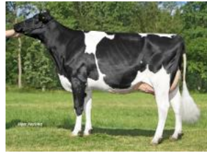
NRP Alisha RDC VG-89