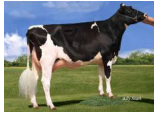
Seagull-Bay Alexa One EX-90