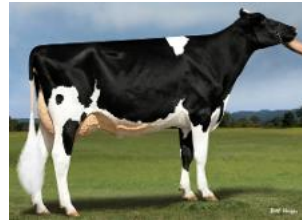
Budjon-Vail Super Woman EX-90