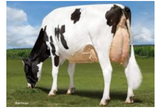
Luck-E Doc Azoozoo RC EX-94