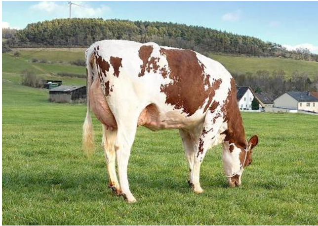
SFH Rabiosa Red VG-86