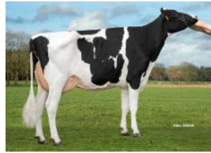
De Oosterhof 3STAR Reevistar