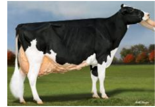
Blondin Goldwyn Subliminale EX-97