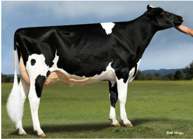
Budjon-Vail Super Woman EX-90