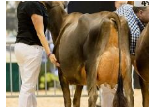
Crossbrook HG Dixie EX-94

Schitterend Jersey-kalf uit Veronica EX-97 familie. Moeder RH Chrome Veronica is Vaarzenkampioen Achterhoek 2025 4e moeder is Veronica EX-97, Supreme Champion World Dairy Expo.