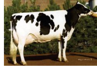
Aitkenbrae Starbuck Ada EX-94

Delta-Lambda embryo's uit de Adeens EX-94. Moeder is de super geuierde Arianne VG-89. Enorm veel exterieur-potentie in deze sire-stack. Crushabull zus van de embryo's won haar klasse op de Schau der Besten 2023!