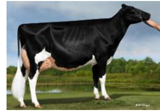
Butlerview Doorman Camilla EX-92, full sister to