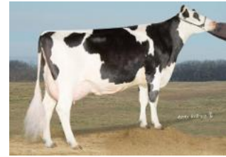
Mtn-View-S Boliv Alexa EX-91