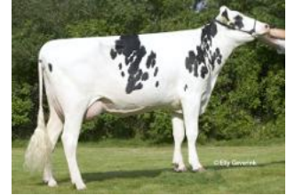
Tir-An O Man Neblina VG-87

Interessante Nextlevel, bewezen koefamilie! Geweldige productie-aanleg, A2A2 & BB. Moeder is halfzus van stier vader Major Tom.