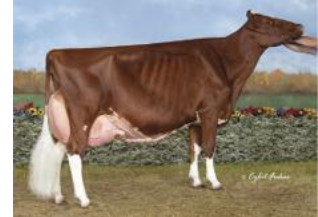
KHW Regiment Apple-Red EX-96

Fraaie Hulu uit de Apple-Red EX-96-familie Geweldige sire stack: Hulu x Delta-Lambda x Thunder Storm! KHW Regiment Apple-Red EX-96: The Queen of the Red Breed!