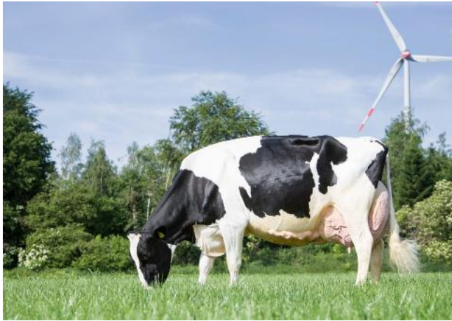
HIN Mexico EX-91