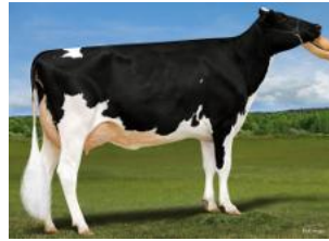
Duckett Chief Vanna VG-88