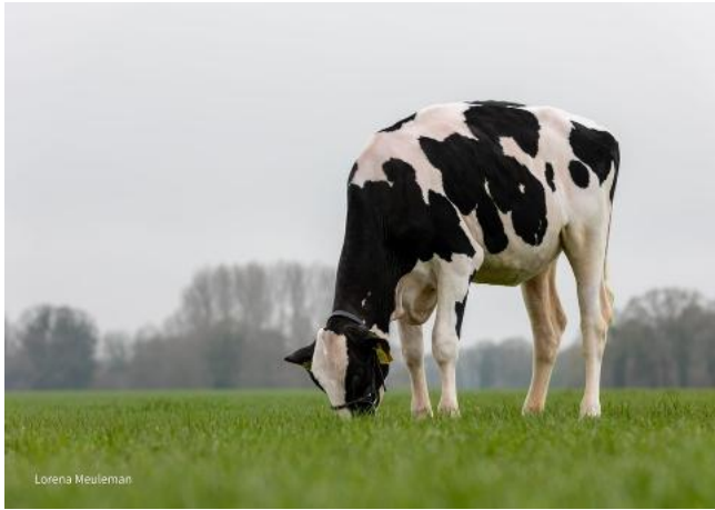
Jageweg Arjuna 2