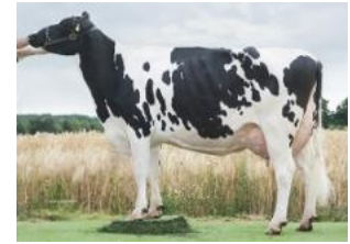
Wilder Kanu 111 RDC VG-88