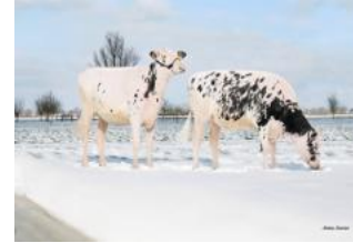
Crushtime Celine & Chief Charlotte VG-88

Delta-Lambda gesekste embryo's! Premier Sire tijdens World Dairy Expo 2024 & 2025 Fantastische pedigree, geweldige show-exterieur!