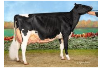
Ms Beauty Black Velvet EX-96