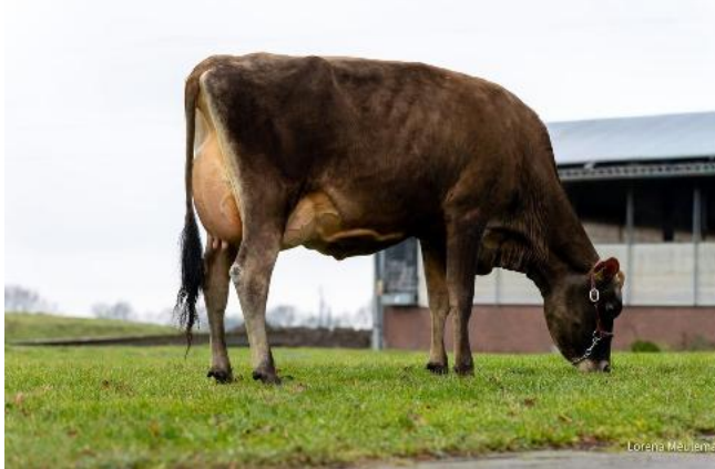
RH Chrome Veronica