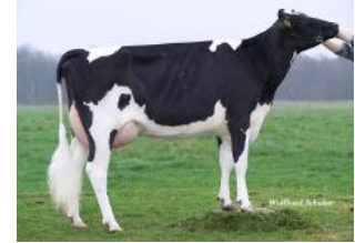
WEH Janne VG-86