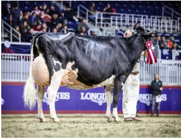
Jacobs High Octane Babe EX-96