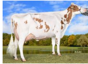
Wilder K25 Red EX-90