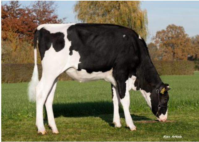
Holbra Dropbox Sublime