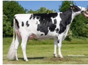
WSH Great GP-83