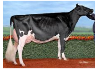
Jacobs High Octane Babe EX-96