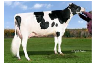
Jenniton M-O-M Savana-Et EX-90