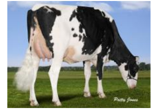
Rainyridge Super Beth RDC VG-86