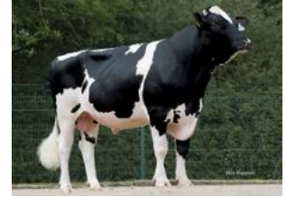
Same family: Cogent Supershot

Roodfactor Sainz P RDC met hoge gehalten. Hoge fokwaarden voor uiergezondheid en levensduur. Zelfde familie als Koepon Marpon, Reformer, Showking & Beatclub.