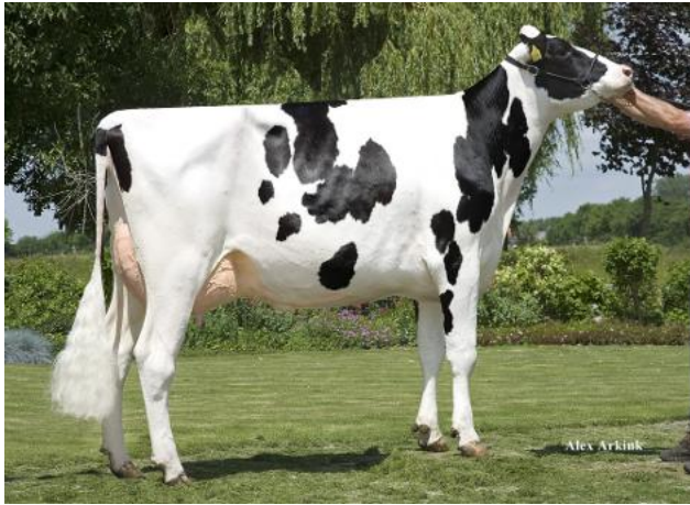
Barnkamper Marilyn 381 VG-88