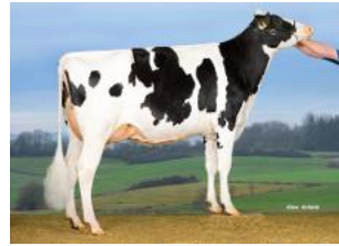
SFH Rosaria RDC VG-89