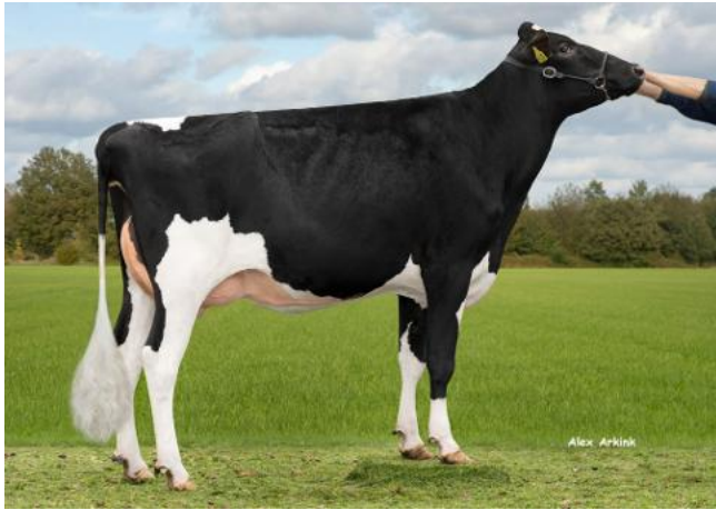
3STAR OH Reevival VG-87