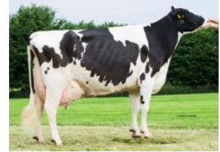
HIN Mogli EX-90, Bookem x Malta VG-88

3337 gTPI Fargo uit de productieve HIN M-familie. Met 932 NM$ de #4 NM Fargo in Europa. Enorm veel productie-aanleg, gecombineerd met solide exterieur.