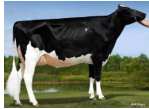
MS Ariannas Door Armani VG-85