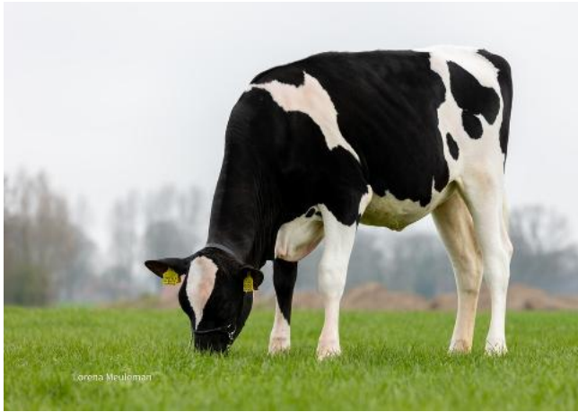
Jageweg Aniek 2