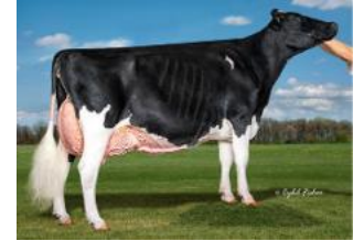
Rach-Len Dundee Lilly EX-97

Hinge (+12 Conf), kleinzoon Have Not 8784 EX-96 ($1.9 M) Eye Candy met super show-exterieur pedigree! Lilli's Luder is een schitterende show-pink, als pink al 3x Kampioen! Junior Champion HHH 2025 - Junior Champion Veekeuring Fryslan 2025 - Junior Grand Champion RSN 2025 - Res. Junior Champion Master Typ Cup 2025 (DE)