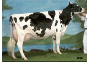
Blondin Skychief Supra EX-93