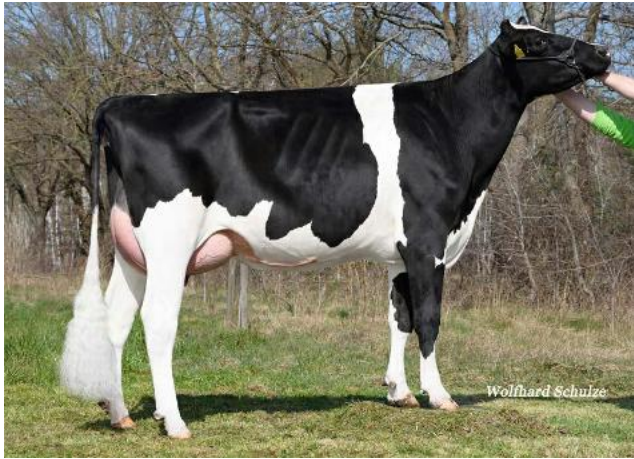
WEH Rosita VG-86