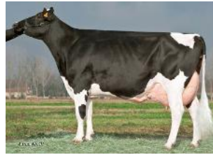
Royal Idevra Titanic Estate EX-90