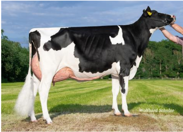
Nieke 460 VG-87