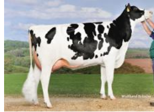
RR Elisa Marie VG-86