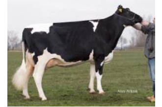
Sunday ALH Prudence VG-88

Roodfactor Sainz, A2A2 & foutloos profiel. Gehalten, uiergezondheid en exterieur, ze heeft het allemaal. Stammoeder Rose RDC VG-89, ook de bron van de Red Range-familie.