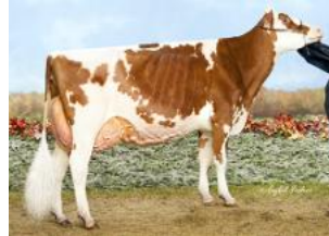
Miss Apple Snapple Red-ET EX-96