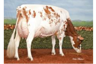
Blondin Redman Seisme EX-97, Redman x Red-

Hoogdrachtige Doc, direct uit Subliminal EX-97! De legendarische Subliminal is de Star of the Breed 2021! Show-exterieur gecombineerd met levensproductie!