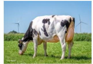
GEN Leanne VG-87 (Batman x Aline VG-85) VG-

Solide Hi-Note met 3326 gTPI en allround profiel. +1.1 DPR & +4.2 PL: garantie voor hoge levensproductie. Volgende moeder is PH Aline EX-93, halfzus van fokstier Dynamic P.