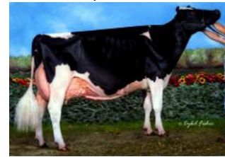
Ms Exels Dundee Beauty EX-95

Zeer fraaie Delta-Lambda, de Premier Sire! Dit kalf is in potentie de 6e generatie Excellent op rij. Black Velvet EX-96 is Champion Bred & Owned WDE 2025.