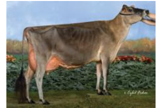
Arethusa Veronicas Dasher EX-95