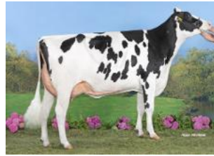
Koepon Shvr Classy 228 VG-86