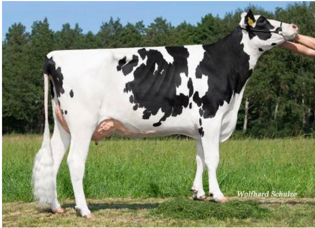
WEH Ballona VG-88