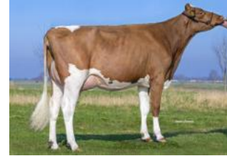
3STAR Christina Red VG-86

Maak een roodbonte Crimson EX-94 nakomeling. Doral-Red (sx), 1 van de hoogste roodbonte exterieurstieren (+1.90 PTAT). Unieke pedigree voor roodbont show-exterieur!