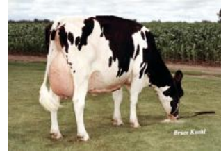
Ralma Juror Faith EX-91

Allround Alster, A2A2 & uit de Faith EX-91 familie. 150 gRZG, 126 RZGesund & 128 RZE, compleet profiel. Familie van fokstieren Ralma Focus, O-Man Crickett & Gold Crown.