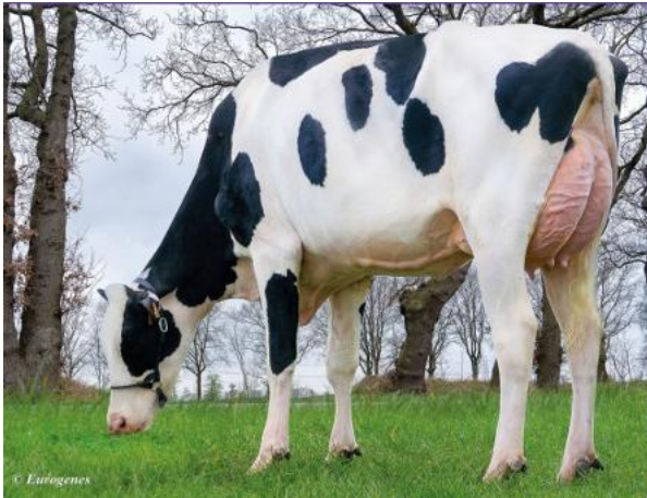
Friendship Genetics Sasha VG-87