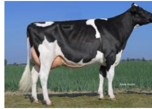
K&L KD Ciracha VG-85