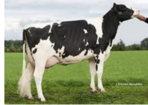
Wilder Kanu 111 RDC VG-88