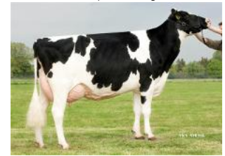
Holbra Pam VG-87

Eén van de hoogste Rock PP dochters, 156 gRZG. Exceptionele gehalten, gecombineerd met positieve gezondheidskenmerken. De internationaal bewezen Red Range-familie, leverancier van vele topstieren.