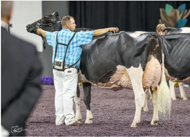
Ms Beauty Black Velvet EX-96