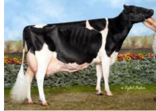
EO Siemers Ashlyns Angel EX-96