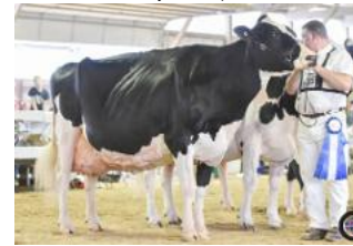
Blondin Goldwyn Subliminale EX-97

Dropbox (+2.72 PTAT) kleindochter Subliminal EX-97. Fraai kalf uit Super Woman EX-90, EX-MS. De legendarische Subliminal, de Star of the Breed 2021!