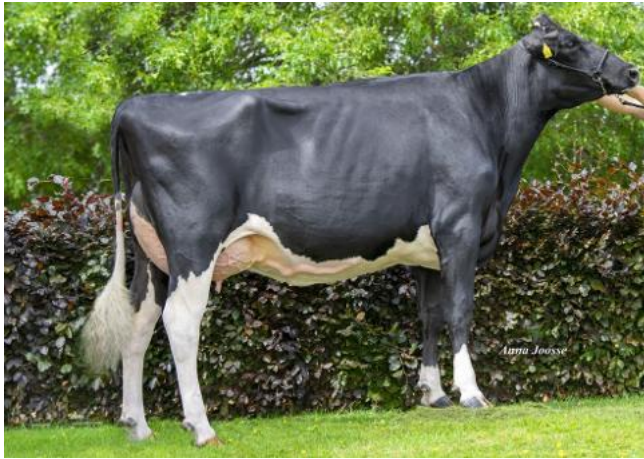
3STAR Cimona RDC VG-88