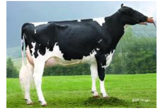
Farnear-TBR Bailey VG-87