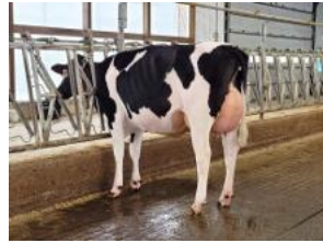
Progenesis Challen Embrace VG-87