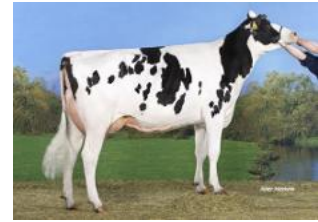
Koepon Mano Classy 93 VG-87