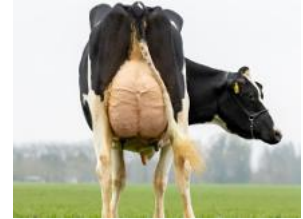
GEN Arjuna VG-89

Number 1 gTPI Hi-Five in Europa! Fraai kalf uit beste moeder, Arjuna VG-89. Volgende moeder is PH Aline EX-93, halfzus van fokstier Dynamic P.