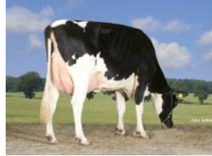
Tirs vad Stol Joc Nemo VG-87