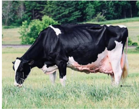
Blondin Goldwyn Subliminale EX-97

Zeer fraaie, spoelbare Doc, direct uit Subliminal EX-97! De legendarische Subliminal is de Star of the Breed 2021! Show-exterieur gecombineerd met levensproductie!