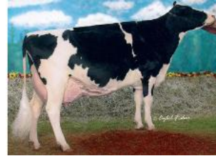
MS Kingstead Chief Adeen EX-94