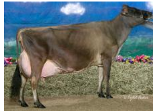
Huronia Centurion Veronica EX-97