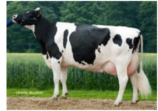
HIN Malta VG-88