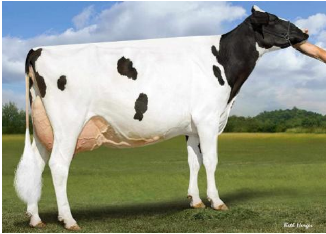
Luck-E Doc Azoozoo RC EX-94