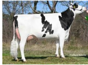
WEH Ballantines VG-88