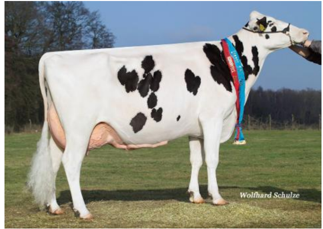
KNS Dorflady EX-92

Johnboy uit de succesvolle KNS D-familie. Vele generaties VG/EX moeders, geweldig exterieur. Hoge levensproductie gecombineerd met vele show-successen!