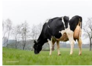
GEN Arjuna VG-89