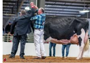
Rach-Len Dundee Lilly EX-97