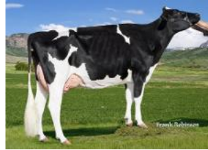
Pine-Tree Dorcy Alexa II VG-88