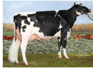
Butlerview Doorman Class EX-91