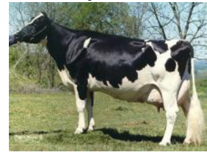
Ridgedale Fond Example EX-93

Attractieve Mican met 3324 gTPI en 345 gNVI. Vroege Mican, hoge gehalten, levensduur en A2A2. Volle zus van de moeder is verkocht voor €60.000.