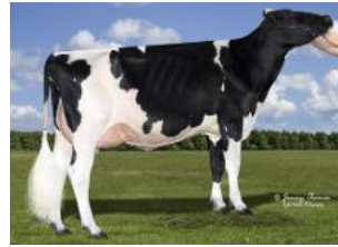
Calbrett Supersire Barb RDC VG-86