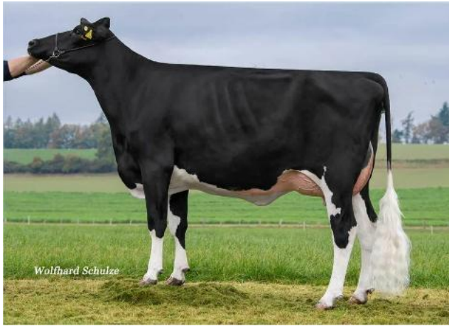
Progenesis Brainwave VG-87