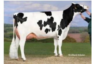
RR Elanie VG-87