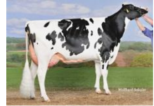
RR Eluisa VG-89

Major Tom met 156 gRZG & 152 gRZM. 110 Kg Vet en 88 Kg Eiwit, enorme productie-aanleg. Terug naar fokkoe Elsa EX-90, de moeder van fokstier Snowman.