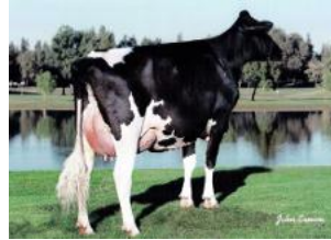
Regancrest-RH Durham Bliss VG-89