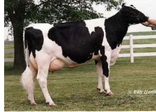
Ricecrest Luke Lauren EX-91