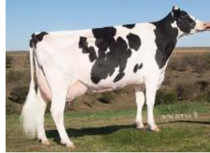
Jenniton Bolton Rowena EX-90