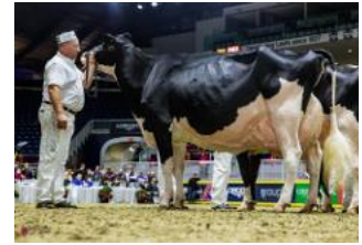
Blondin Goldwyn Subliminale EX-97