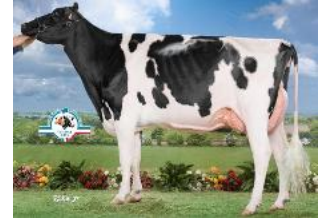
Hermine Tual, family of Maybelline VG-85

Aurora Fargo-dochter met 3247 gTPI. Hoge gehalten en prima gezondheid. Moeder is de fraaie 3STAR OH Reevival VG-87, met hoge gehalten.