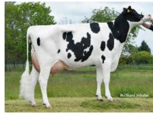
SHA Grumeti VG-87