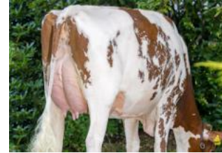
Salsa P Red DE667648712 graas foto

In februari gekalfde, beloftevolle vaars. Hoornloos & rood, fraaie vaars, best geuierd. A2A2 en BB, uit diepe Amerikaanse koefamilie.