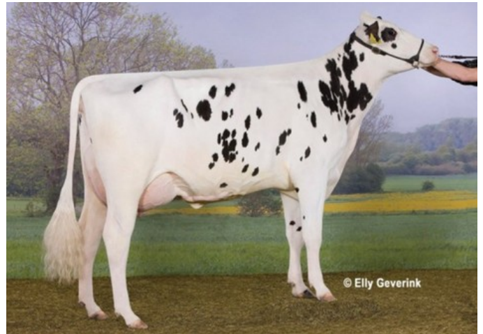
Anderstrup Ramos Camille VG-88

VG-86 Supersire x VG-89 Snowman x VG-88 Ramos x VG-89 Laudan x VG-87 Jocko x VG-85 Mtoto x VG-88 Slocum x VG-85 Southwind x VG-85 Secret x VG-88 Complete