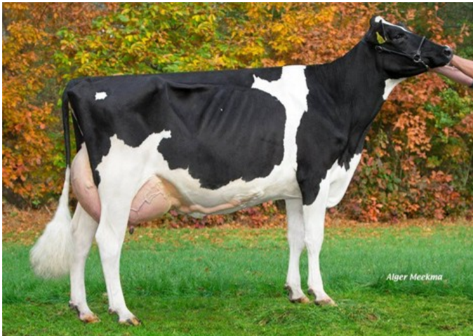
Zandenburg Super Camilla 1 VG-86