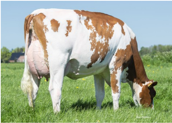
Drouner K&L Aiko 1386 P-Red VG-88