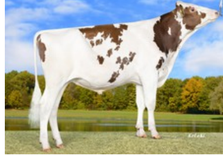
Sudena Safari Red