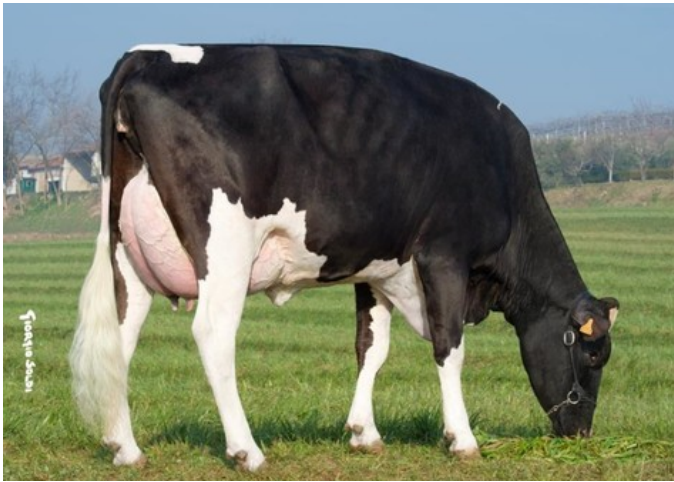
Royal Idevra Eva VG-86