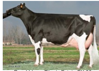
Royal Idevra Titanic Estate EX-90