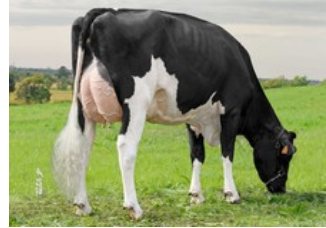
Bertaiola Casper 57 VG-85