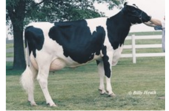
Ricecrest Luke Lauren EX-91

VG-86 Shotglass x VG-86 Bookem x VG-86 Active x EX-90 Titanic x VG-85 Addison x VG-86 Manfred x EX-90 Duster x EX-91 Luke x VG-87 Southwind x EX-91 Ned Boy