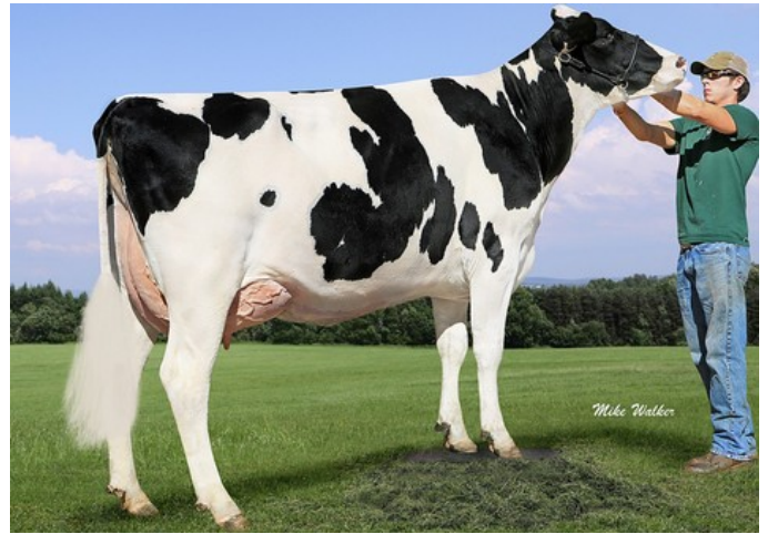
Farnear-TBR-BH Valour VG-88

VG-86 Racer x VG-88 Supersire x VG-87 Shottle x EX-91 Goldwyn x EX-92 Outside x EX-94 Skychief x EX-94 Starbuck x Sheik