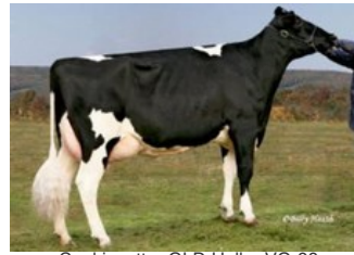
Cookiecutter GLD Holler VG-88