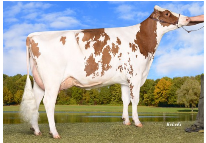
Wilder Saturn P Red VG-88

CR 7 P Red x VG-88 Drone PP Red x VG-86 Martin x VG-87 Yoda x VG-85 Mission P RDC x VG-88 Apoll P Red x VG-85 Brekem RDC x VG-89 Snowman x EX-90 Shottle x EX-90 Lentini