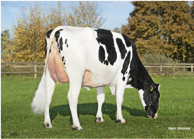
Poppe Shania P RDC VG-88