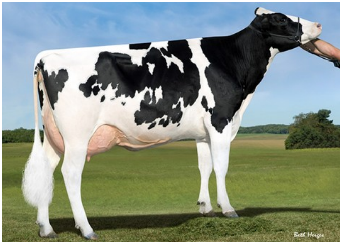
Sandy-Valley Morgan Era GP-83