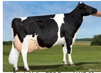
Sandy-Valley RBS Emerald VG-88