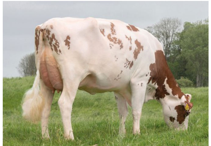
Lakeside Ups Red Range VG-86

Driver RDC x Freestyle-Red x VG-86 Rubels-Red x VG-86 Salvatore Rc x VG-89 Rubicon x GP-83 Aikman RDC x VG-85 Man-O-Man x VG-87 Mascol x VG-88 Durham x EX-90 Rudolph