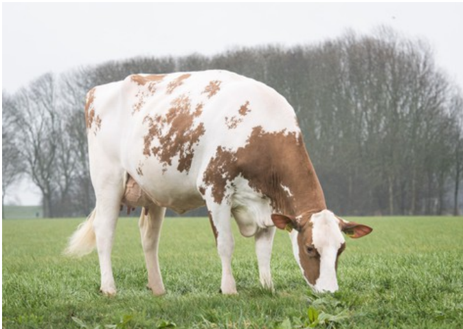
Koepon OH Rubels Range 17 Red VG-86