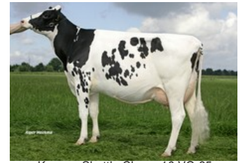
Koepon Shottle Classy 16 VG-85