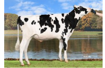
Same family: Koepon Showking

Skat P RDC x Ranger-Red x GP-83 AltaTop-Red x GP-83 Salvatore Rc x VG-86 Silver x VG-87 Man-O-Man x VG-85 Jeeves x VG-85 Shottle x VG-86 Simon x VG-86 Merrill